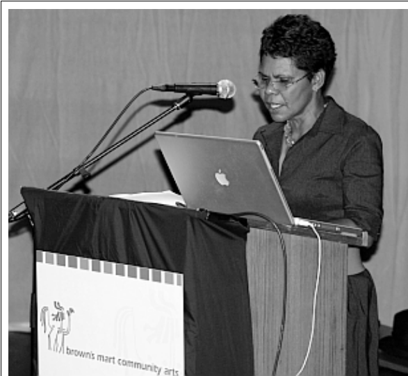
The Hon Marion Scrymgour, Minister for the Arts, addresses the Re-Invention launch at BMCA

We will continue working with communities we've worked with before; but we will also be working more and more locally with communities in Darwin's suburbs and neighbourhoods, fostering arts and cultural practice at the frontline, at the coalface, at the grassroots, wherever communities are.