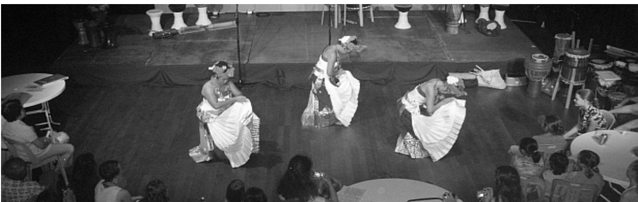
Tunas Mekar Balinese dance group grace the floor at the IWD Celebration event

BMCA in conjunction with Darwin Entertainment Centre and the Cultural, Recreation and Tourism Training Advisory Council will host an accredited training course in theatre technical production including lighting, audio and staging. Details of the course's commencement date and a call for expressions of interest will be announced very soon.