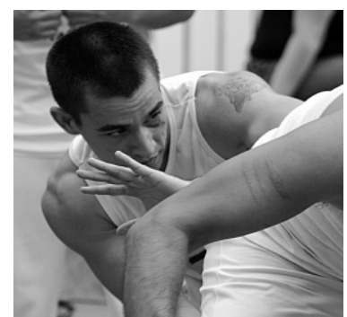
Capoeira beat at the launch

And we will be asking everyone in Darwin to join us as members, to help direct Brown's Mart into the future, and to help make Darwin a place where art is everywhere and where art never stops.